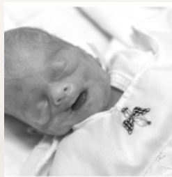
Nothing is ideal, but let's get as close to ideal as possible.