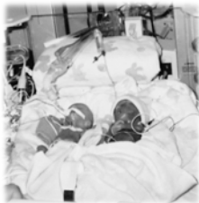
Cooper & Cohen

Gestational Age at Birth: 23 weeks and 4 days